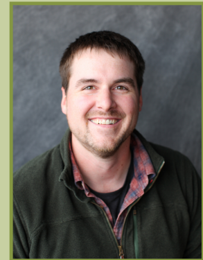
Boston Wakeham Five Valleys Land Trust